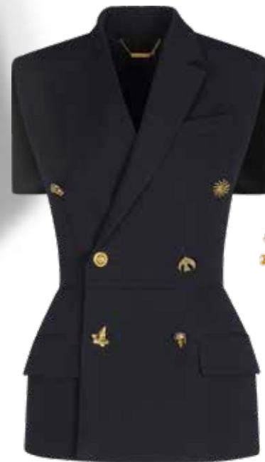
Knit dress with cape $1,757.85

Their wonderful partnership with Hepburn lasted a lifetime, to the point that their relationship with Hepburn was at the center of local poetry.