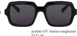
acetate GV Anima sunglasses $372.20

Since then, the provincial government has made perfumes for Hepburn. Hepburn was a friendly manner with the perfume has also served as models, but Givenchy had served as a collection of the topic of conversation as commercial models