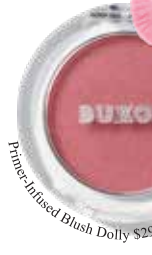
Now, it's time to show you a colorful pink with spring on your face.