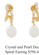
Crystal and Pearl Decorated Spiral Earring $596.41

Since then, the provincial government has made perfumes for Hepburn. Hepburn was a friendly manner with the perfume has also served as models, but Givenchy had served as a collection of the topic of conversation as commercial models